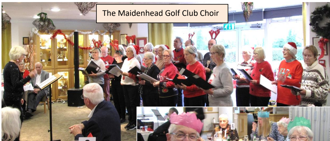
The Maidenhead Golf Club Choir

Before lunch, the Golf Club choir entertained us with a lovely selection of Christmas songs.