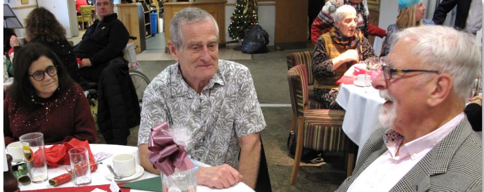
These updated photos of our lovely volunteers and trustees will be added to Sequela's website.